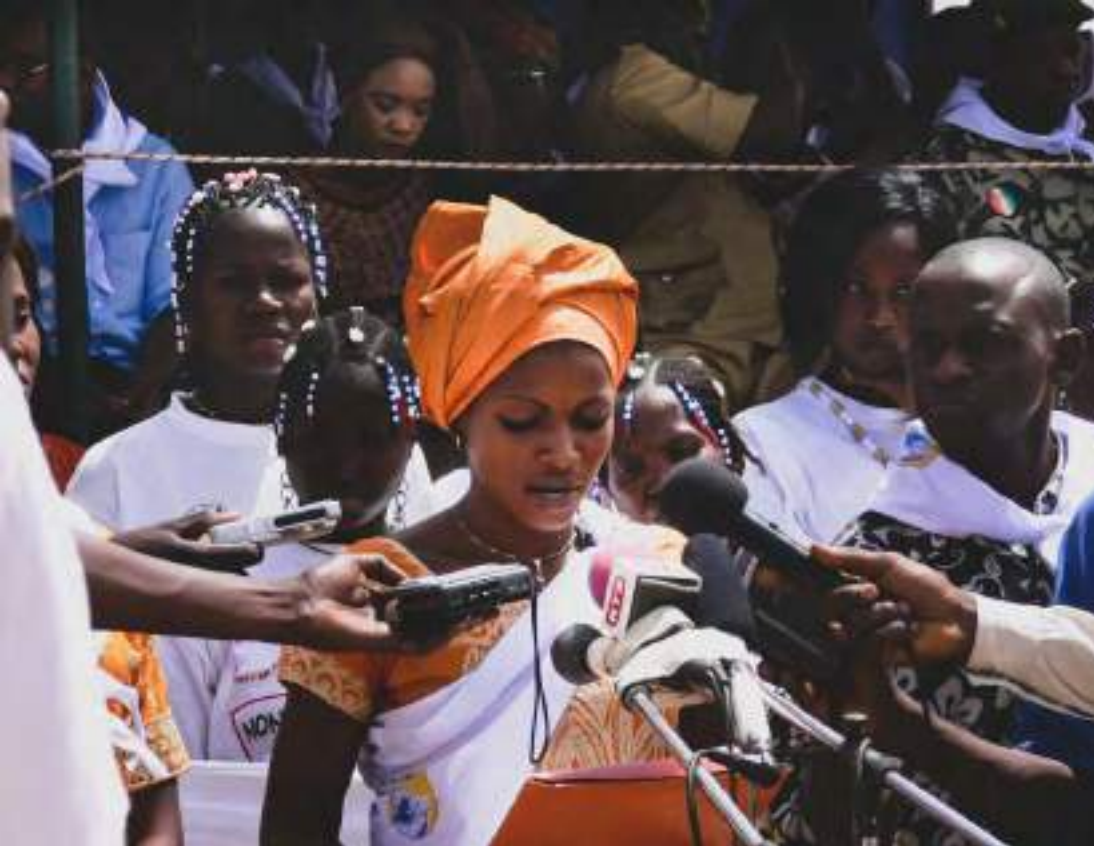
A woman reads her community's declaration of intent to abandon harmful practices (Senegal).

The success of the first pilot training in 2017 convinced Tostan to launch a new project in 2019 to reach 85 CMCs, as well as the Departmental and 11 District Councils in the Department of Medina Yoro Foulah (Kolda region, Southern Senegal). In 2019, Tostan Supervisors implemented the training in all 85 CMCs. The Tostan pedagogical team will train the 11 District Councils and the Departmental Council in 2020, and develop a new SDCE module promoting good governance through practices of transparency, accountability, and participatory budgeting and financial reporting.