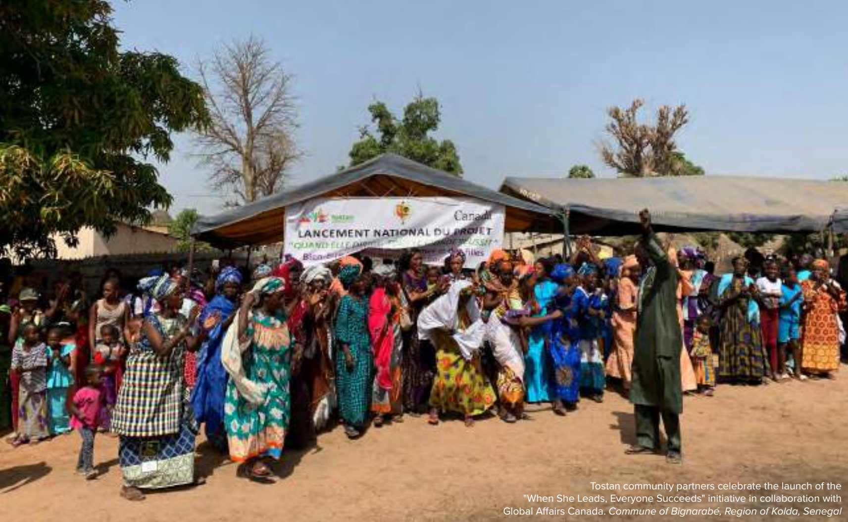
Tostan community partners celebrate the launch of the "When She Leads, Everyone Succeeds" initiative in collaboration with Global Affairs Canada. Commune of Bignarabé, Region of Kolda, Senegal