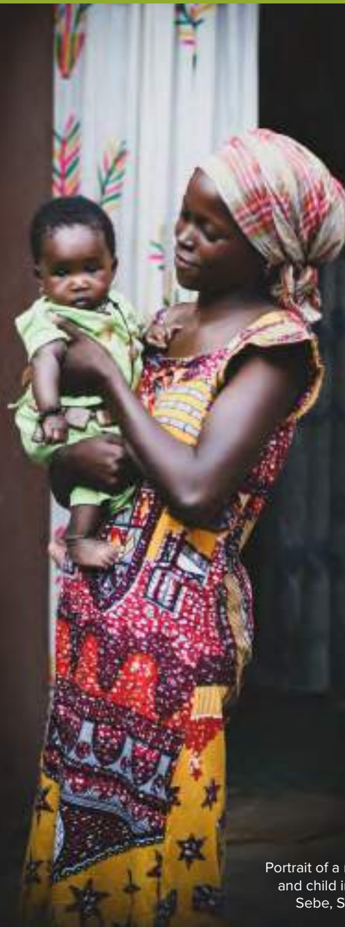
Portrait of a mother and child in Sedo Sebe, Senegal

Tostan staff from the international and country offices began training on how to use “Bountoug” — a Pulaar word meaning granary and the name chosen for the data management tool — began at the end of the year. It is Tostan’s hope that Bountoug will enable the organization to better analyze data, cross-reference data from various sources, and share information with internal and external stakeholders for more informed decision-making.