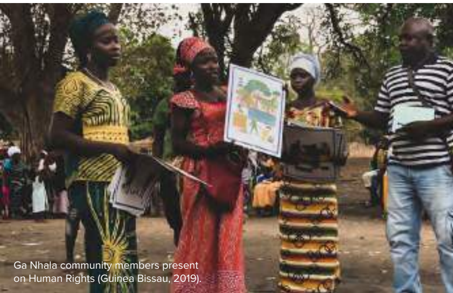
Ga Nhala community members present on Human Rights (Guinea Bissau, 2019).