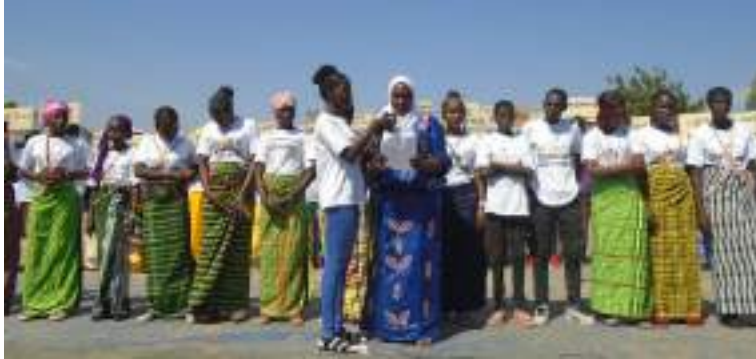
Declaration in Djiredji, Senegal, December 2019

2019 was a unique year for Tostan Senegal, as several projects ended in late 2018, and the launch of the CEP in 120 new communities scheduled for the Fall was split between late 2019 and early 2020. Nonetheless, Tostan Senegal also kicked off the second pilot for Strengthening Democracy and Civic Engagement (SDCE) modules on decentralization, good governance and transparency for local elected officials and Community Management Committees. In 2019, 40 CMCs were trained