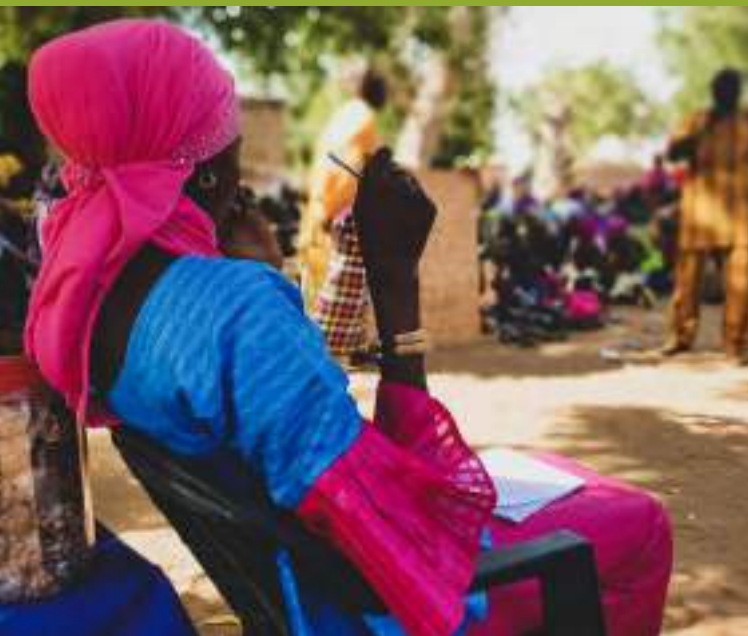
Woman participates in the CEP Program, 2019

Tostan believes that every person, regardless of age, sex, religion, nationality, or economic status has inherent human rights which assure their dignity as human beings. Our human rights-based, respectful, inclusive, holistic, and sustainable model strengthens individual as well as collective agency and empowers communities to realize their own vision of well-being through a respectful process of community-led development. Known as the Community Empowerment Program (CEP), this model has been implemented and has evolved since 1991, leading to the empowerment of thousands of communities.