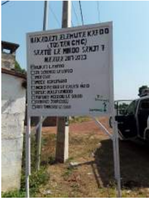
Community vision board in The Gambia, 2019