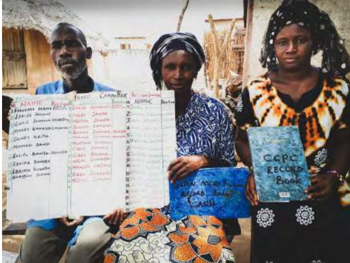
Song Kunda CMC members show their project logs and budget during an April meeting (The Gambia, 2019).

Thanks to their tireless efforts, the CMCs, class participants, and community members raised awareness via concrete actions within their villages and across hundreds of neighboring communities on subjects learned in the CEP related to good governance, the importance of education, good hygiene and preventive health measures, as well as ending harmful practices. Among other achievements in 2019, CMCs contributed to resolving family disputes and village conflicts, led successful vaccination campaigns, organized campaigns against cigarette smoking, held meetings with herders to encourage them to avoid grazing livestock on farmlands during the rainy season, promoted birth registration, distributed mosquito nets, purchased school supplies for elementary students, organized community clean-ups, as well as coordinated latrine and well construction. A breakdown of activities organized by CMCs in all countries can be found in each National Update attachment to this Annual Report.