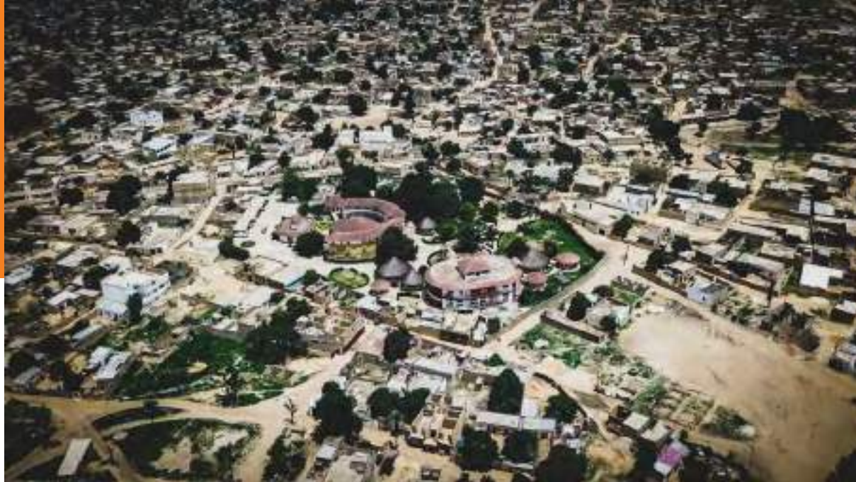
Aerial view of the Tostan Training Center (Senegal, 2017).

The TTC also hosts internal trainings which are important spaces of exchange and learning among Tostan staff from all departments. In October and November 2019, the TTC hosted two five-day trainings, one in French and one in Wolof for the Tostan International and Senegal offices, the TTC service providers, and pedagogical field staff to share the Tostan CAMS. Tostan plans to offer this training to all Tostan staff, regardless of their hierarchical positions.