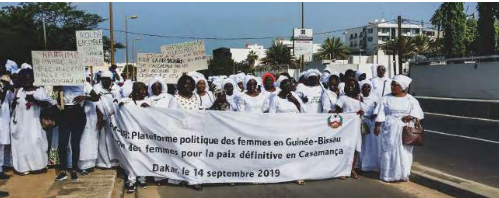
Women from Senegal, The Gambia, and Guinea Bissau participate in a September march for peace in the Casamance as part of the Peace and Security project (Senegal, 2019).

1,333 people (including 1,179 women) implemented Income Generating Activities through a revolving loan scheme with funds provided by the Tostan Community Development Fund