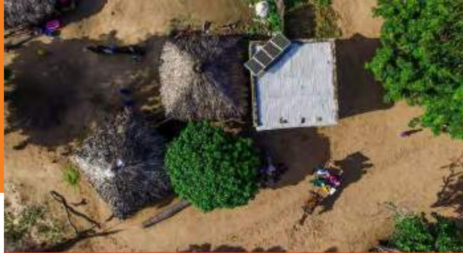
Aerial view of Soundiane, Senegal (2017).

Tostan has achieved remarkable results in community well-being for millions of people in thousands of communities in West and East Africa over the last 29 years. As rural communities, nonprofits, international organizations, and governments from many parts of the world ask Tostan to share its approach with them, the SEP will serve as the guide to scaling partnerships as well as global and local impact.