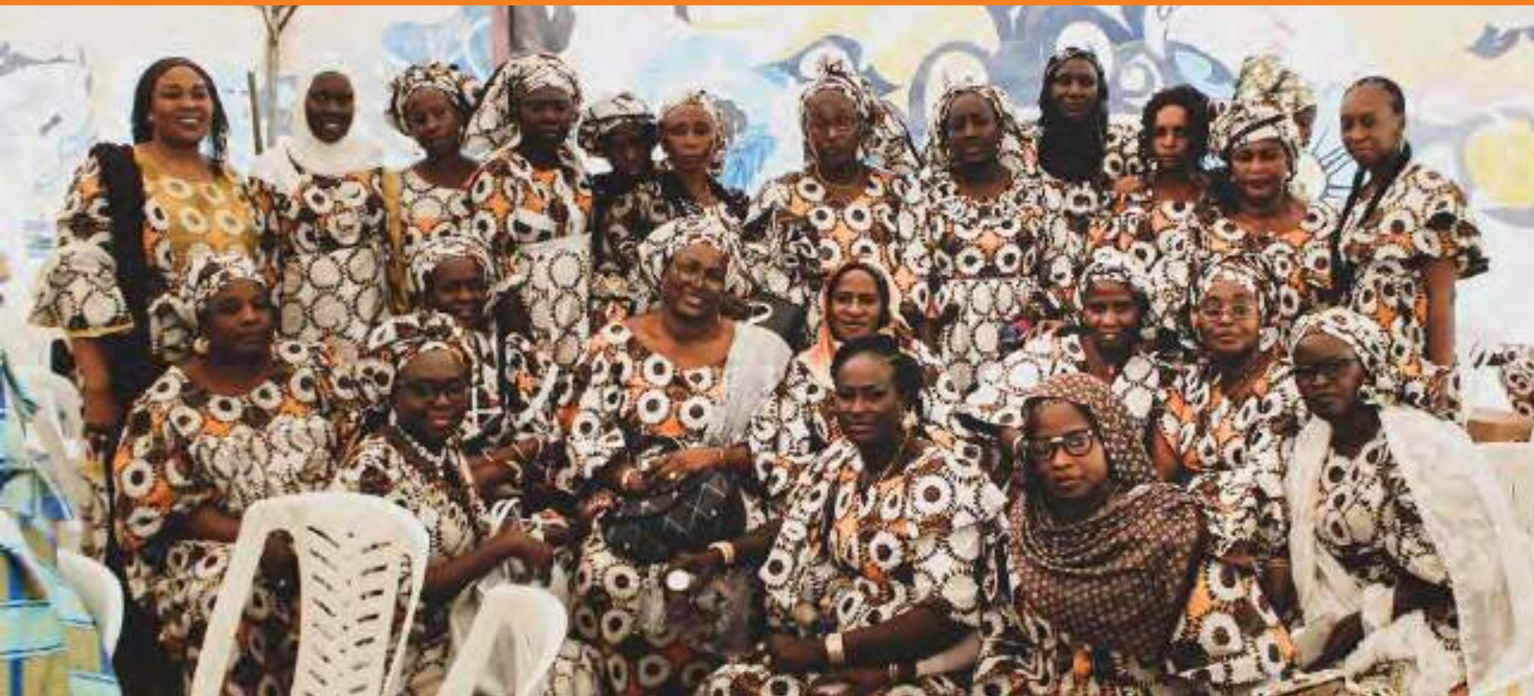
Tostan Senegal staff and Prison Project detainees celebrate International Women's Day (Senegal, 2019).

Launched in 2003, Tostan's prison project is currently being implemented in nine prisons in Senegal, mainly for women and for children under 18 years old.